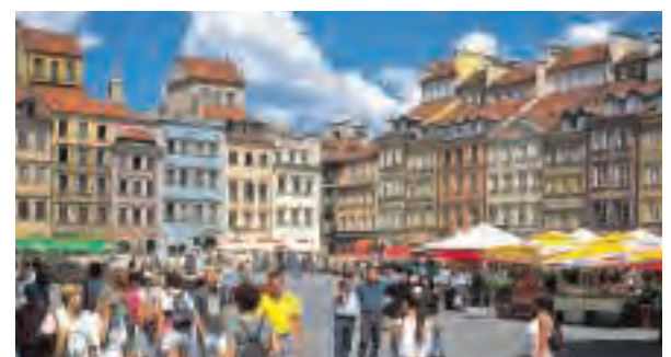
The Old Town of Warsaw was reconstructed after WWII