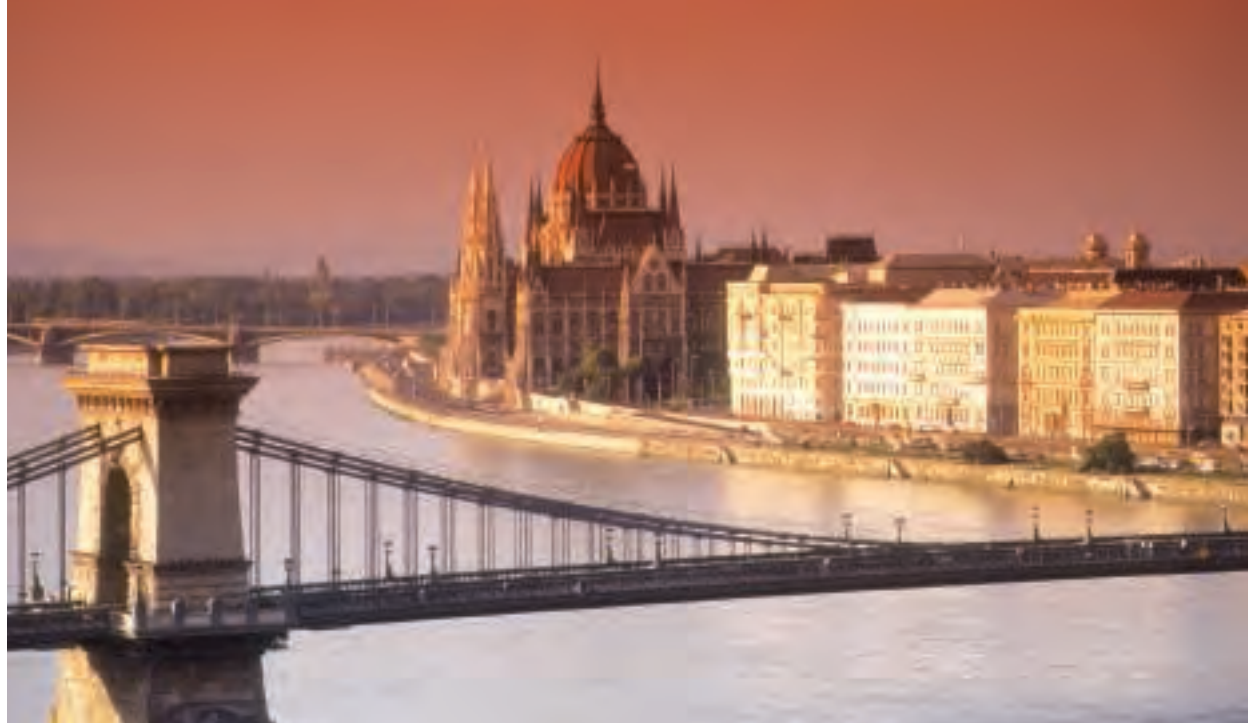
From the lofty heights of Buda's Gellert Hill, look over the Danube to Pest's Parliament building bathed in the glow of twilight

Delve behind the former 'Iron Curtain' to find medieval charm, a rich culture infused with religious devotion and some confronting reminders of W/WII.